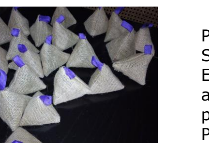
POUPURRI SACHETS Elaborated with aromatic herbs put in a cloth bag. Price:1€