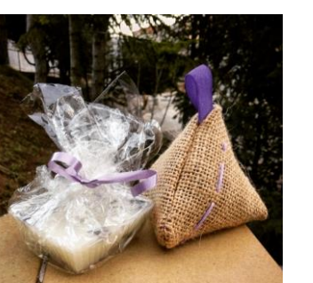
CANDLE Made with original form molds. Price:1 €