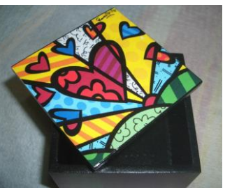
LITTLE BOXES Decorated by the members of the cooperative with meaningful Gaudi details. Price: 4€